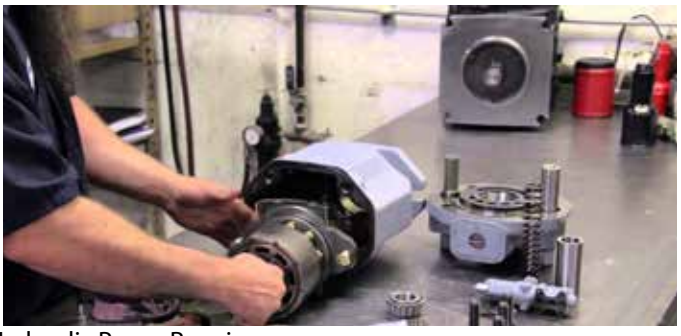
Hydraulic Pump Repair

engine, aux engine, Hydraulic Motor, Hydraulic Cylinder, pumps, Gearbox, Hydraulic Winch, boiler, crane, deck machinery.