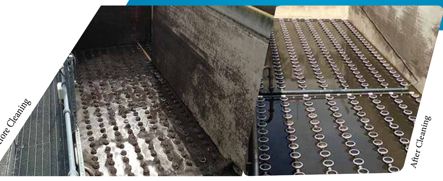
2.5 TANK CLEANING, DE-MUCKING & DE-SLOPING

We can provide Tank Cleaning, De-sludging, De-slopping, and De-mucking facilities in Singapore