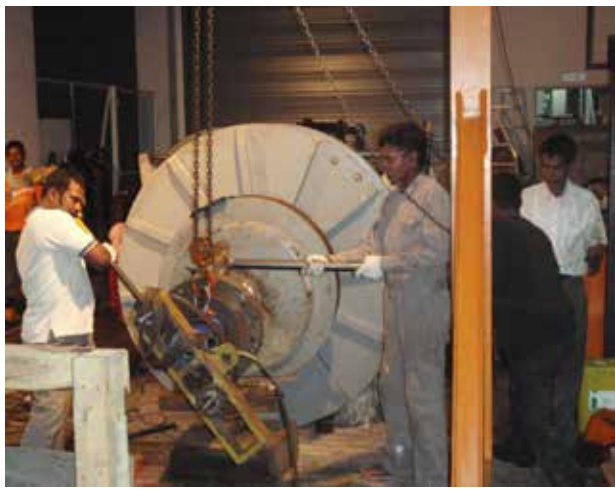
and supplied new bearings to fit.

The vessel's main deck anchor windlass was removed by floating crane and transported to workshop for repairs to her shaft. The damaged shaft was realigned