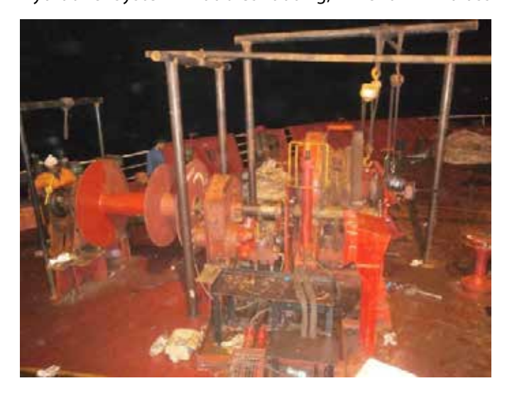
Major Repair In-situ, Anchor Windlass Overhauling, and Anchor Windlass Clutch and Coupling Reconditioning.

Repairing / renewing of all work of Anchor Windlass such as new Anchor Windlass Inspection, Anchor Windlass Hydraulic System Troubleshooting, Anchor Windlass