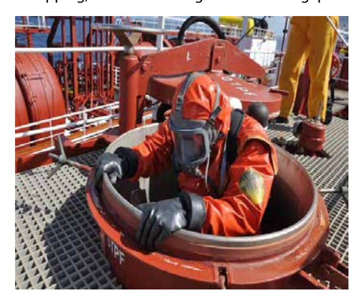
with a very competitive price by following all MARPOL regulation & requirement.

We can provide Tank Cleaning, De-sludging, De-slopping, and De-mucking facilities in Singapore