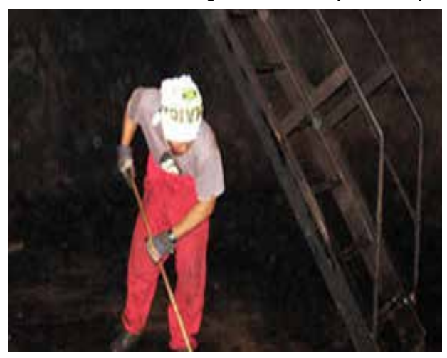
Environment (HSSE) and compliance policies as well as all local and regional environmental regulations.

We collect all waste at the time of cleaning than dispose in an environmentally-friendly manner instead of discharge into the sea. The entire process is in line with following Health, Safety, Security &